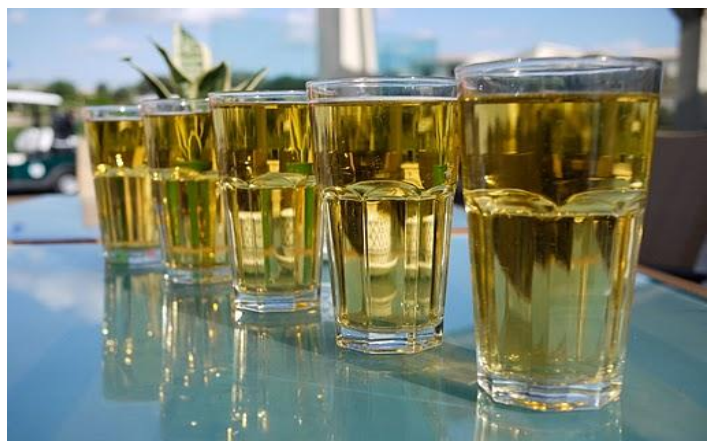
The Friendship from Service Golf Society in Cyprus with guests "Brokeback & Ridgeback"